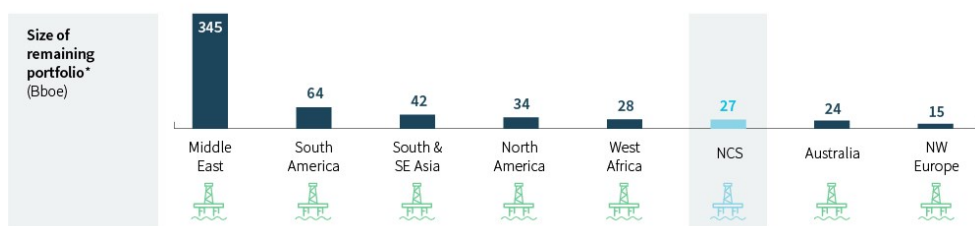
Figure 8. Remaining resources on the NCS as compared to other basins (Rystad Energy, 2021)

* Total volumes in fields in production, under development or discovered, but not yet produced as of 1.1.2021.